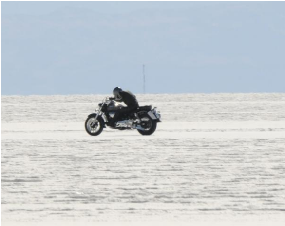
S&T's Jimmy Park on the Salt in excess of 100 mph