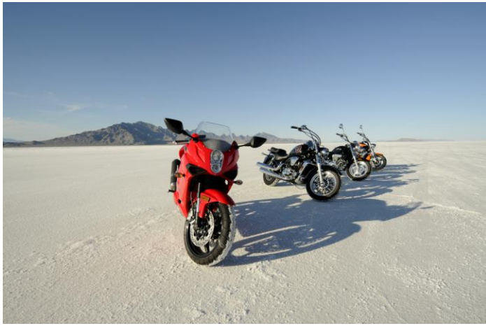
ATK's on the Salt at Bonneville