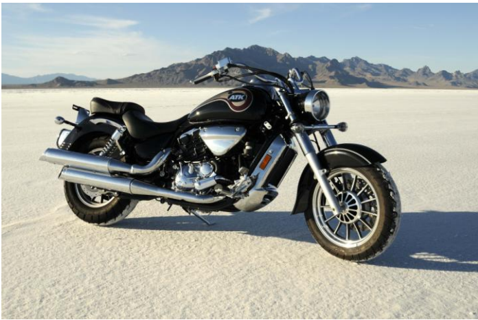
ATK 700 V-Twin Cruiser